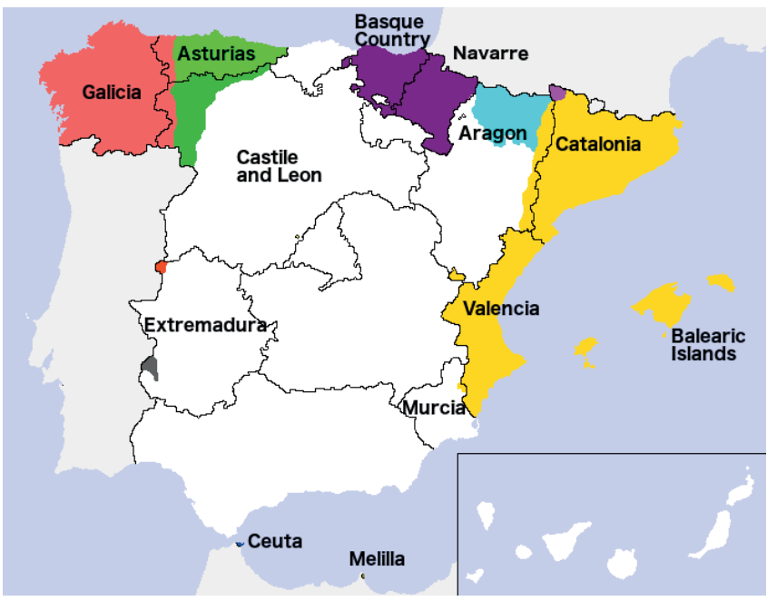
Map 2. Geographical distribution of the minority languages in Spain